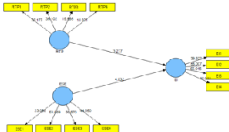
Figure 2. Structural Model- Direct Effects

Upon the effective assessment of measurement model, the study examined the structural model. In this, 5000 bootstraps were applied on 261 cases to outline the significance of the path coefficients (Hair et al., 2016; 2014; Henseler et al., 2009). At first, the direct effects were examined between entrepreneurial self-efficacy, risk taking propensity and entrepreneurial intention, details of which can be obtained from figure 2 and table 4.