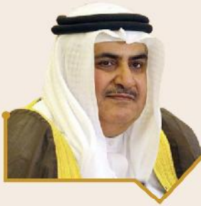
H.E Shaikh Khalid Bin Ahmed Bin Mohamed Al Khalifa Minister of Foreign Affairs

"I received with deep thanks and appreciation the offered copy of "QITAF", the periodical newsletter of the Arab Open University- Bahrain Branch. The newsletter clearly reflects the great educational and awareness efforts your esteemed university wields, and embodies your upright approach in enhancing communication frameworks with students and graduates and fostering interaction with the institutions of the Bahraini community. May God bless you with good health and happiness and grant your esteemed university further progress and prosperity."