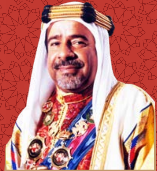
H.H. Shaikh Isa Bin Salman Al Khalifa