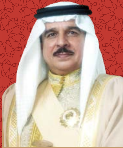
His Majesty King Hamad bin Isa Al Khalifa