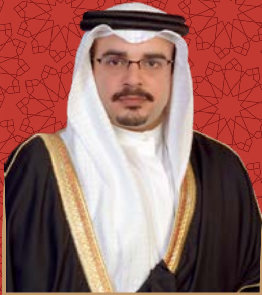
His Royal Highness Prince Salman bin Hamad Al Khalifa