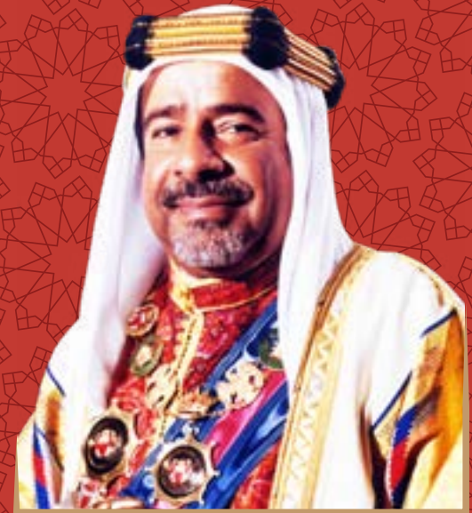
H.H. Shaikh Isa Bin Salman Al Khalifa